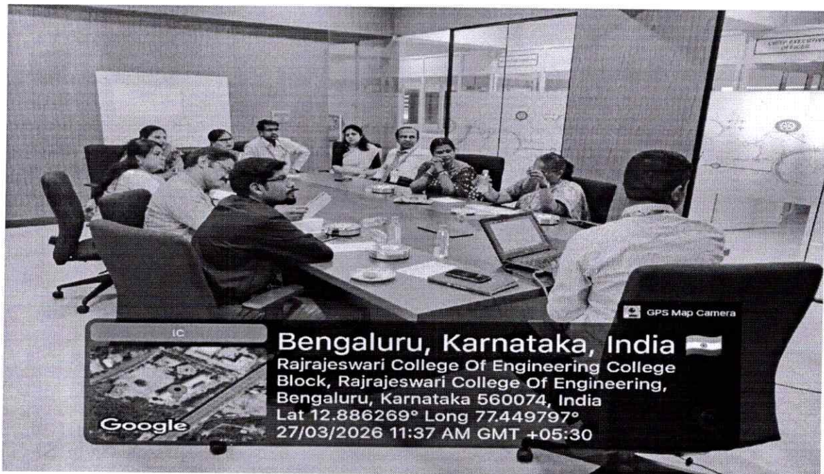
Figure 2: Discussion on Proposed 2024 Syllabus (5 th to 8 th Semester) in Fourth BoS meeting in presence of BoS members

Campus: #14, Ramohalli Cross, Kumbalgotu, Mysore Road, Bengaluru – 560074