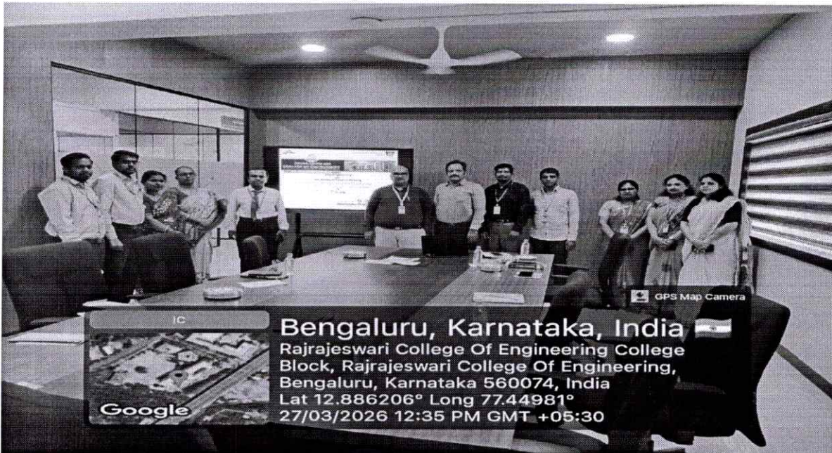
Figure 4: Group Photos of Fourth BoS meeting in presence of BoS members, Principal, Assistant Dean Academics, BoS Chairman, Departmental staff members