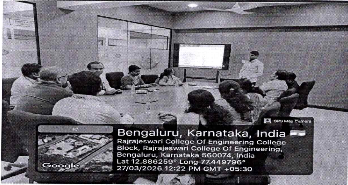
Figure 1: Presenting the Proposed Scheme 2024 (5 th to 8 th Semester), 2025 (3 rd to 4 th Semester) & 2024 Syllabus (5 th to 8 th Semester), 2025 Syllabus (3 rd to 4 th Semester) in Fourth BoS meeting in presence of BoS members