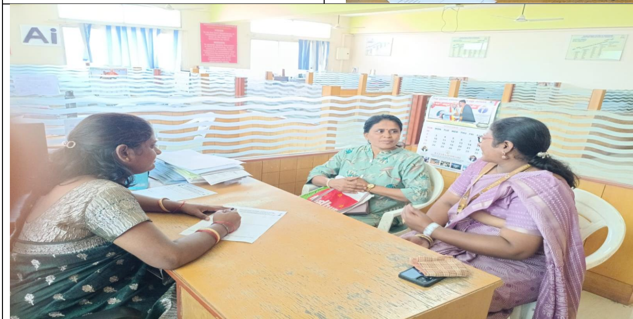
HOD discussing the student's academic performance, attendance, and development with the parents during the PTM.