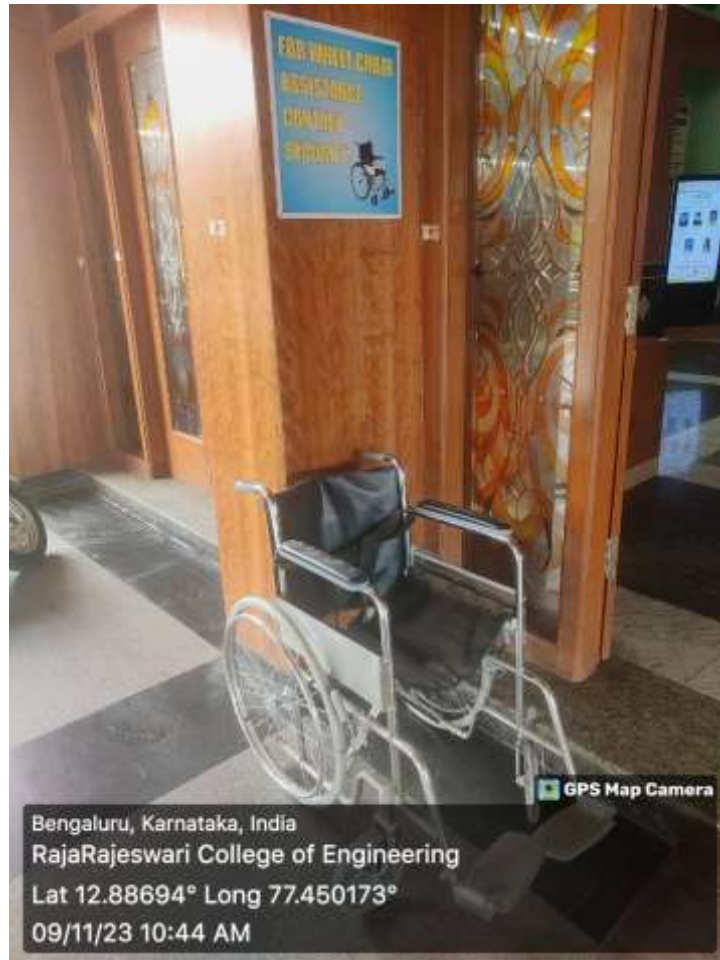
Photo.8: Wheel chair facility available at the college entry gate.