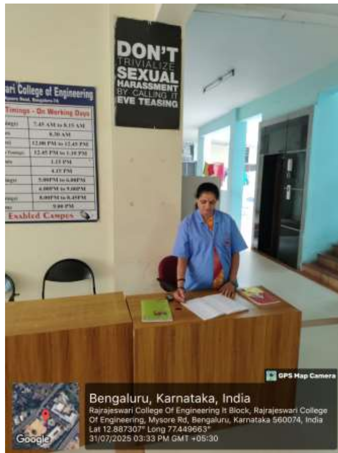
Photo. 9: Human assistance for both visitors and individuals at entrance

To ensure transparency and accessibility, the institution issues circulars regarding the availability of readers and scribes for examinations. These circulars are prominently displayed in notice periods, serving as a proactive communication tool to inform students about the supportive measures in place. This commitment reflects the institution's dedication to creating an equitable educational experience for all its students, emphasizing accessibility and equal opportunities for academic success.