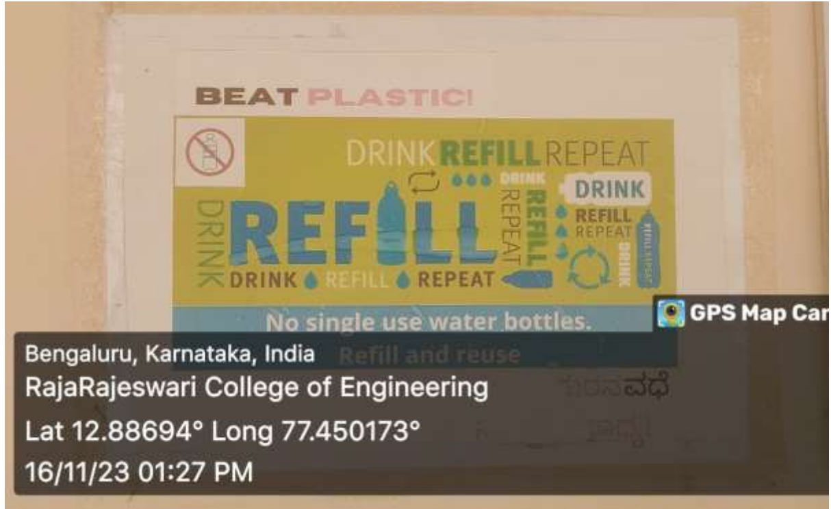
Photo.3: Information hand out on recycling of plastic in daily life is displayed in notice boards