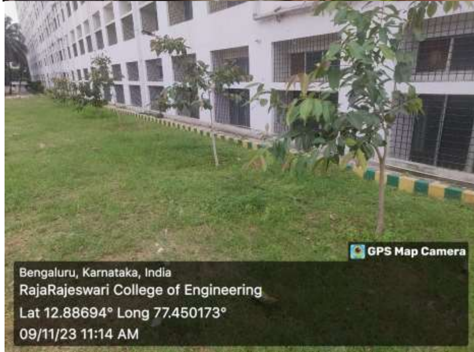
Photos.4: Landscaping with trees and plants within a college campus