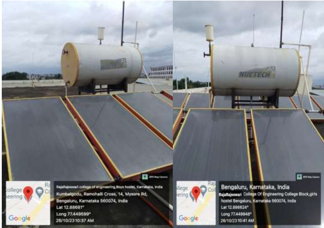
Photo.9: Cleaning solar water heating system collector panels on roof tops