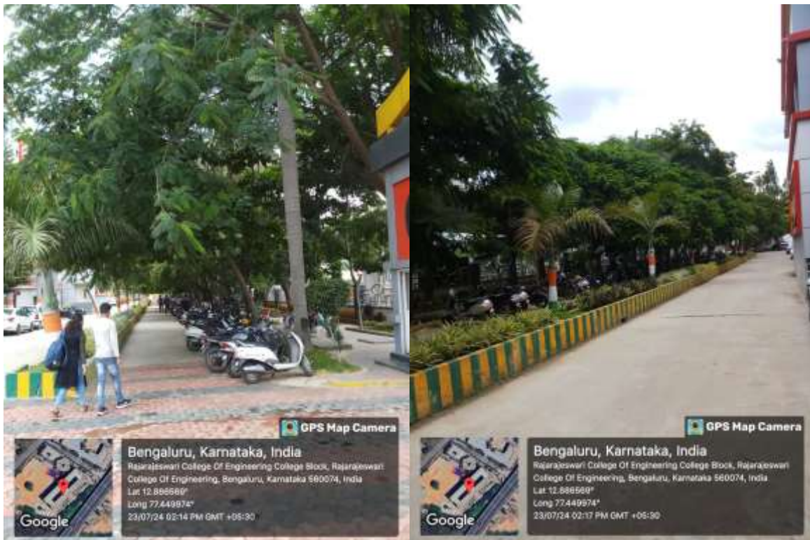
Photo.4 Green Belt Development at RajaRajeswari College of Engineering

Due to the nature of the vegetation, characterized by small and shallow roots, the water demand is relatively high. Therefore, a meticulous and frequent watering regimen is implemented to meet the specific needs of these plants. On any given non-monsoon day, the total water requirement for this purpose amounts to 35 thousand liters per day (KLD).