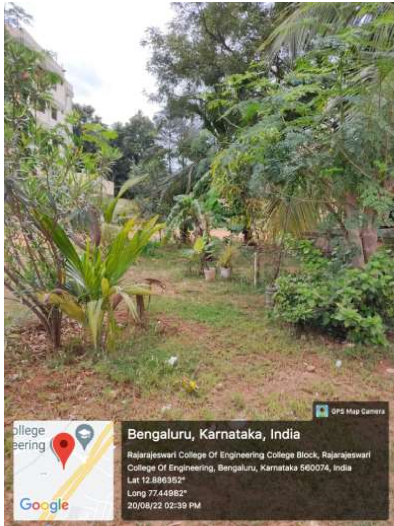
Photo.7 Gardening near mess area