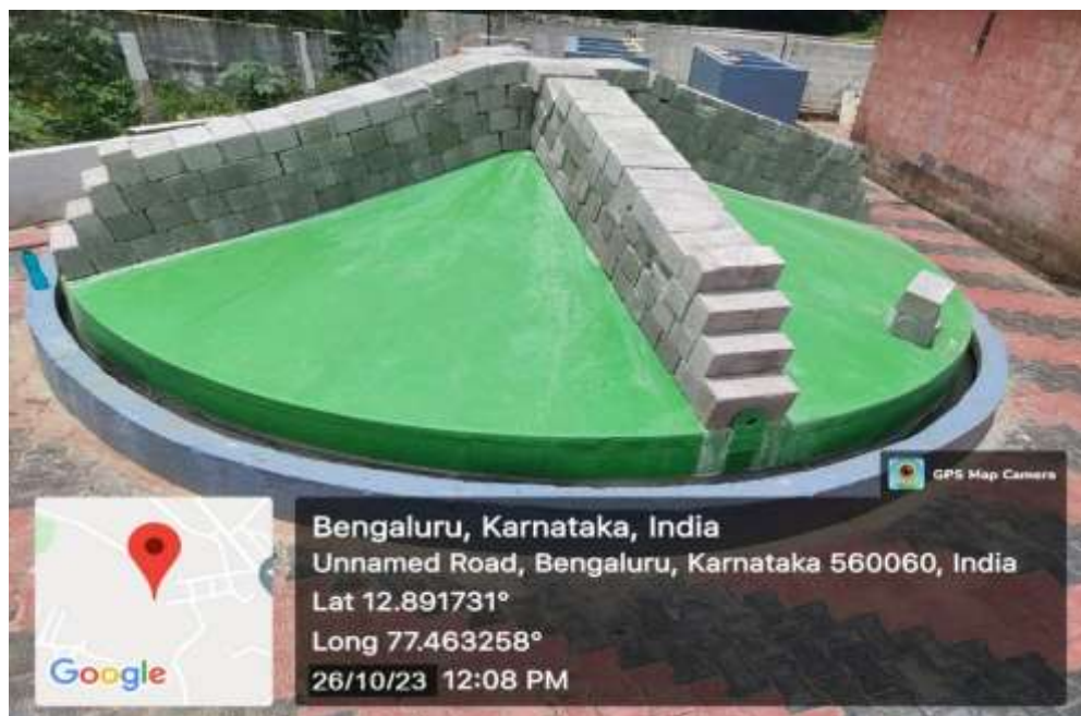
Photo.2: Centralized Bio-gas plant at RajaRajeswari Medical College and Hospital (RRMCH)