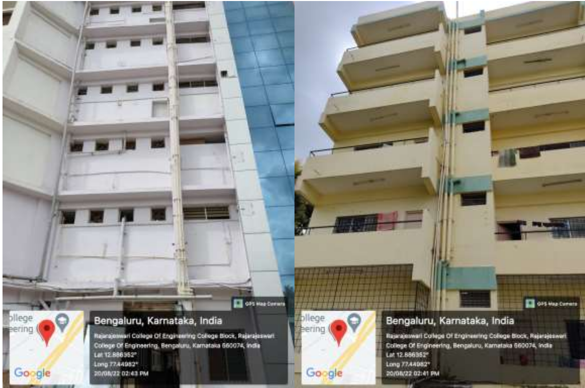
Phor.5 Dual Plumbing for Secondary Flushing

Dual plumbing system has been provided in Boys Hostel, Girls Hostel. In general a sum total of 20 KLD is required for the flushing purpose.