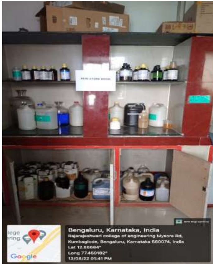
Photo.10. Acid store room in chemistry lab to store hazardous chemicals

Typically, the campus does not generate any hazardous waste from its various departments. When batteries reach the end of their life cycle, they are exchanged for new ones to ensure proper disposal. To maintain safety standards, specific precautions are implemented, particularly in chemistry laboratories where concentrated acids and chemicals are stored. These hazardous materials are securely housed in a designated room, minimizing potential risks and ensuring a safe working environment.