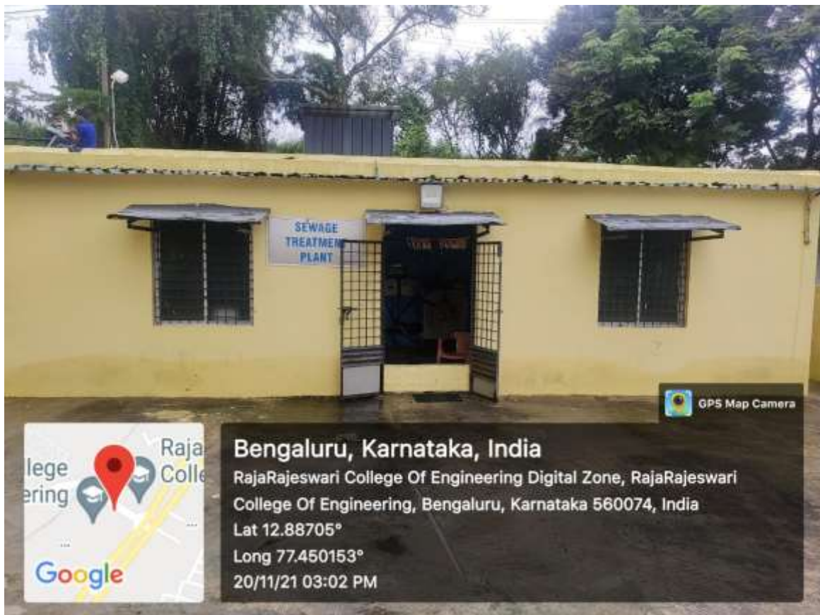
Photo.3: Sewage Treatment Plant of 100 KLD in operation at RajaRajeswari Dental College and Hospital (RRDCH)

The collection process involves gathering waste water from both the college and hostels, directing it into the under drainage system leading to the STP. The treatment process employs the Activated Sludge Process (ASP) system, a biological treatment method where aerobic bacteria stabilize organic matter and neutralize microbial populations. The STP consistently delivers effluents with Biochemical Oxygen Demand (BOD) values below 10 mg/l. Further, the aerobic treatment, coupled with disinfection, ensures microbe concentrations below 100 units, adhering to consent stipulations. Regular analysis reports are submitted to the KSPCB to demonstrate compliance with all specified parameters. This underscores the institution's commitment to environmentally responsible practices and regulatory compliance in the management of liquid waste.