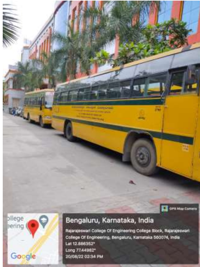
Photo.6 College bus fleet and washing area