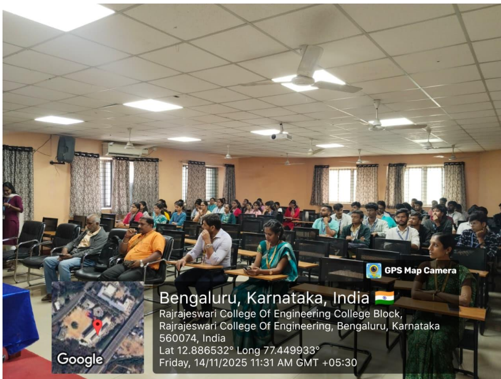
Fig.2 Students and faculties sitting inside the program