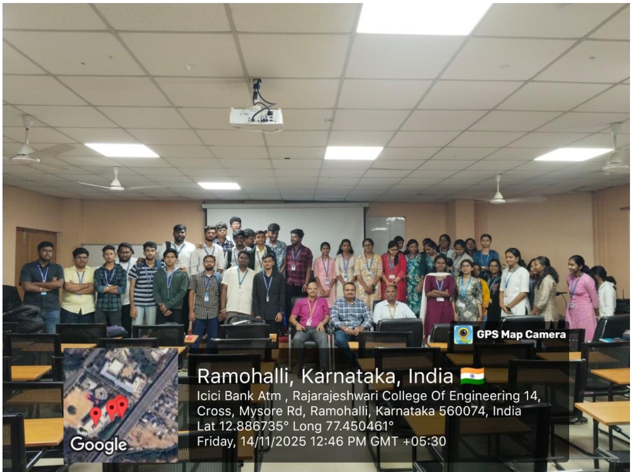
Fig.4 Group Photo taken after the program