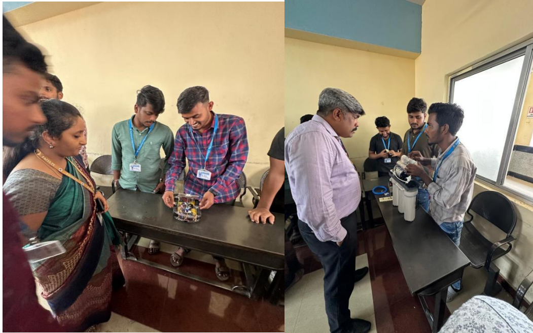
Students Explaining their Project in Expo.