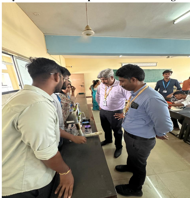
Students Explaining their project to faculty and HOD.

Campus: #14, Ramohalli Cross, Kumbalgodu, Mysore Road, Bengaluru – 560074