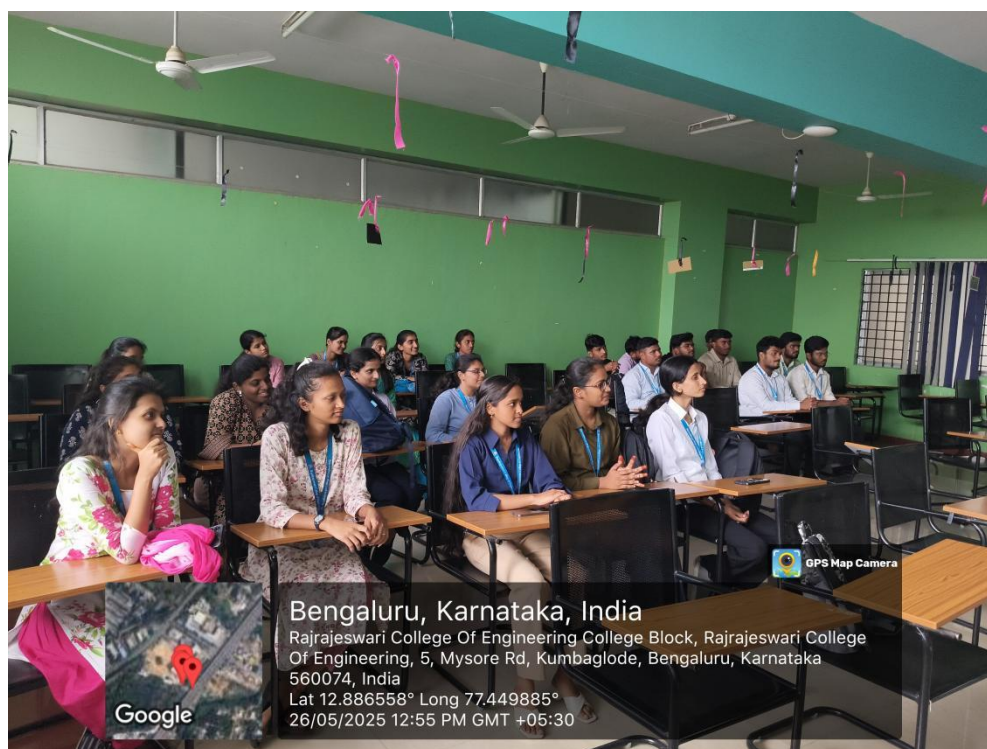
Students attending for Interview.

Campus: #14, Ramohalli Cross, Kumbalgodu, Mysore Road, Bengaluru – 560074