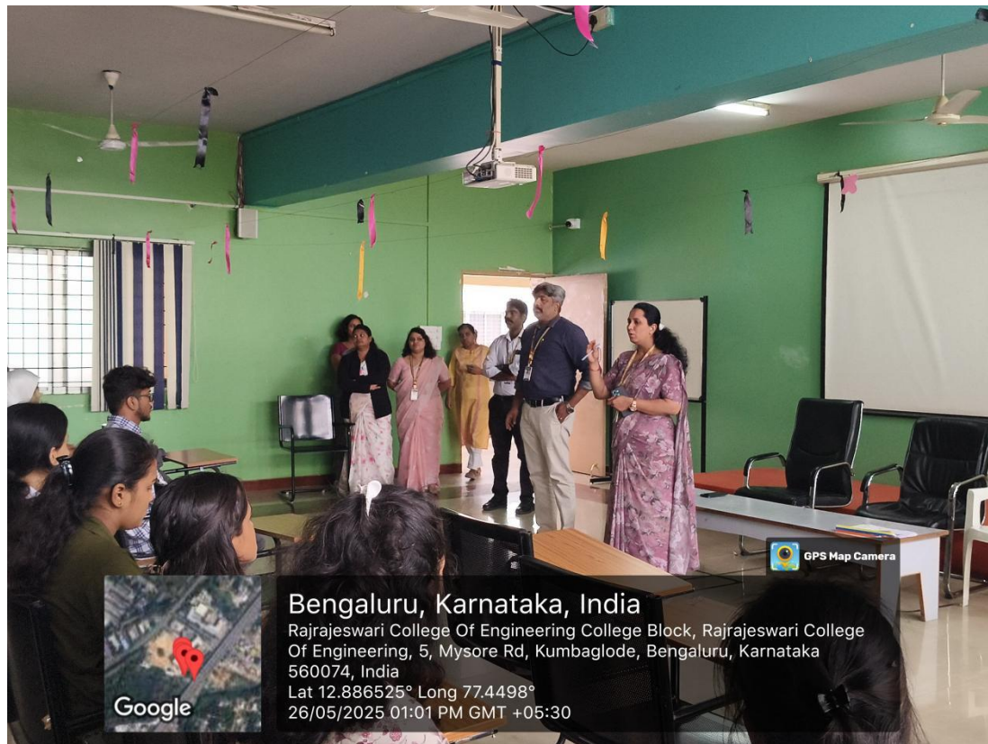
Students Adressed by Interviewers and shared their review.