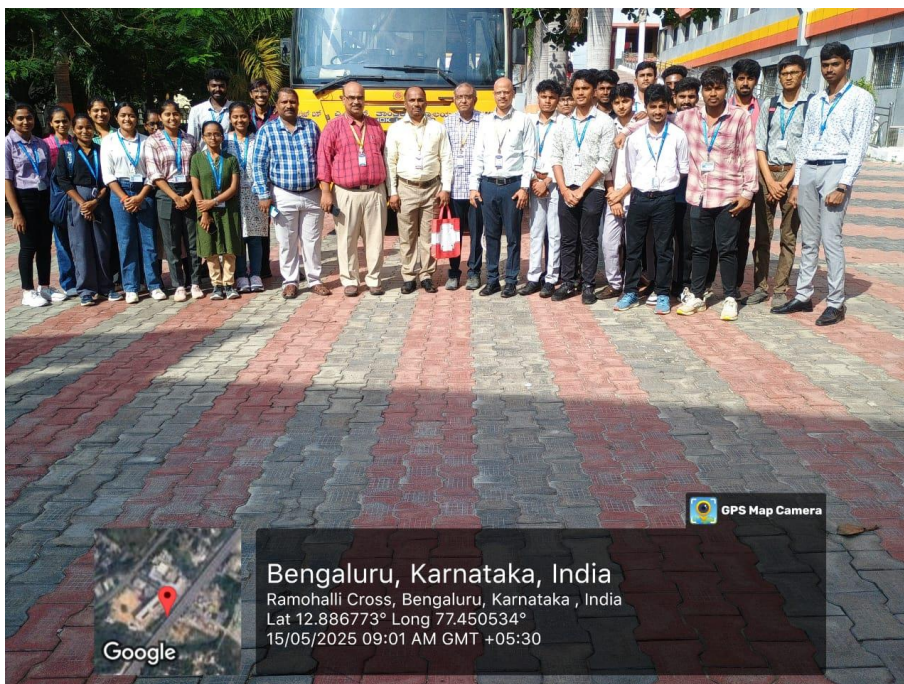
Students of 6 th Semester, Department of Robotics and Automation Visited to Tayota Kirloskar Motors, Bidadi