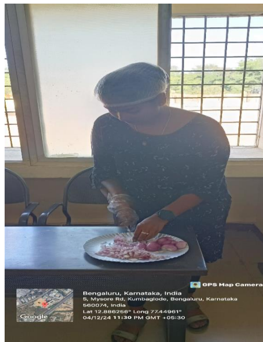
Students Preparing their food items for selling in Foodex Festival.

Campus: #14, Ramohalli Cross, Kumbalgodu, Mysore Road, Bengaluru – 560074