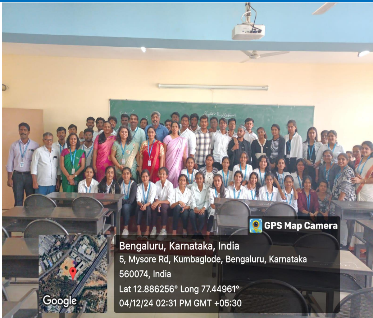
A Group photo of Staff and 3 rd sem students of Electrical and Electronics Engineering Department during Foodex Festival