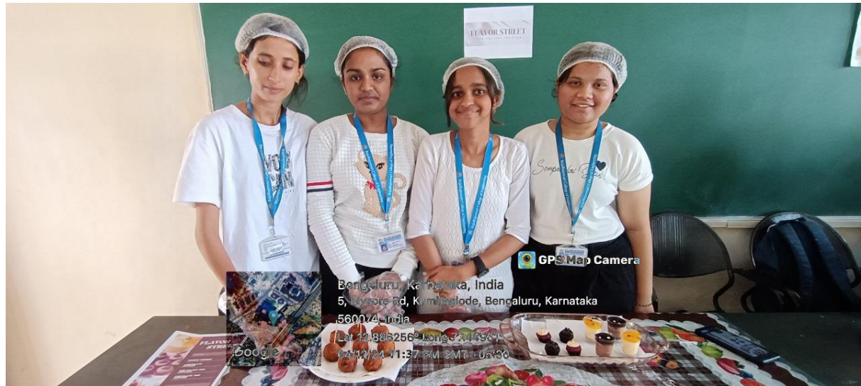
Students Readiness for selling their foods in Foodex Festival.