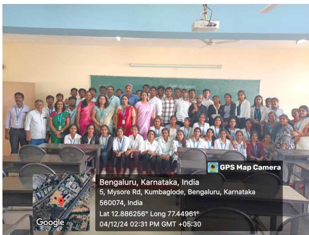
A Group photo of Staff and 3 rd sem students of Electrical and Electronics Engineering Department during Foodex Festival

Campus: #14, Ramohalli Cross, Kumbalgodu, Mysore Road, Bengaluru – 560074