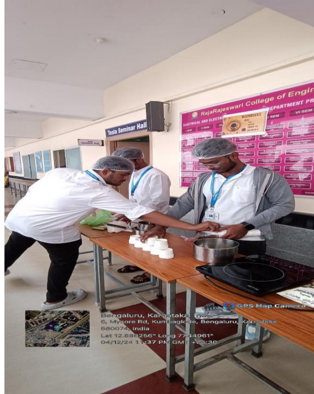
Students Preparing their food items for selling in Foodex Festival.