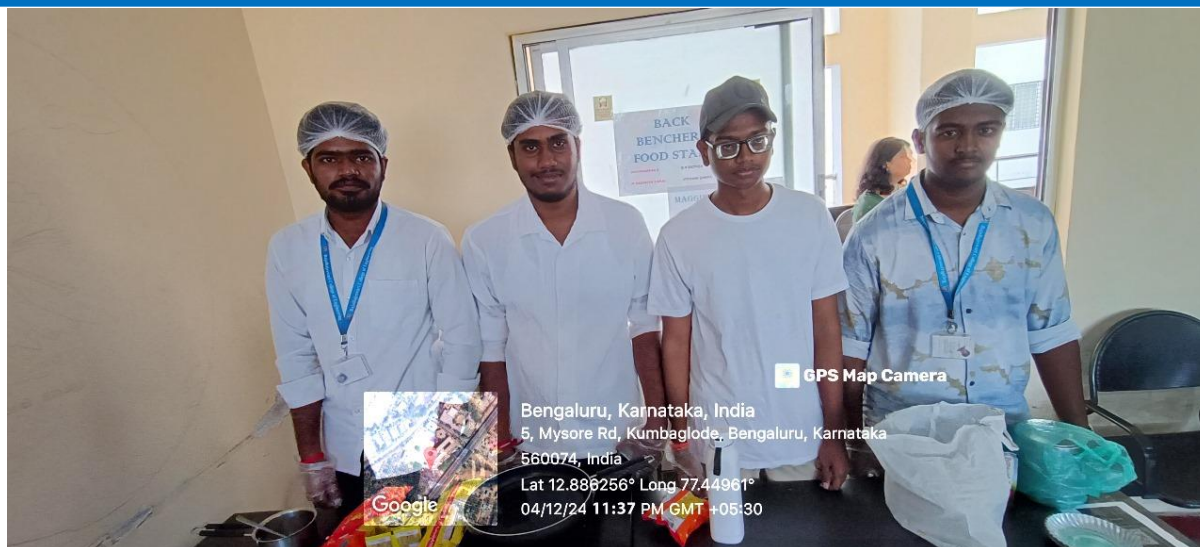
Students Selling their Food product in the Foodex festival