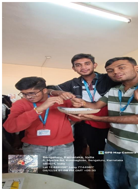
Students enjoying the food products during Foodex Festival