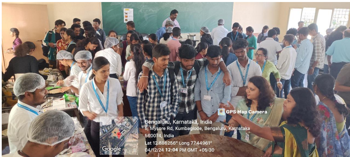
Students Selling their Food product in the Foodex festival

Campus: #14, Ramohalli Cross, Kumbalgodu, Mysore Road, Bengaluru – 560074