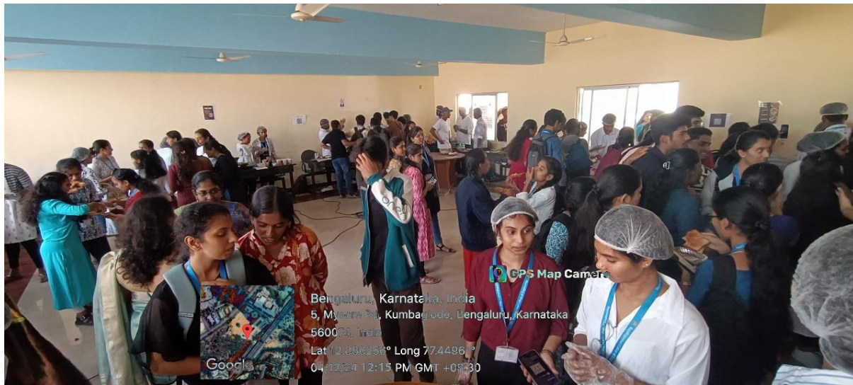
Students and Staff enjoying the food products during Foodex Festival