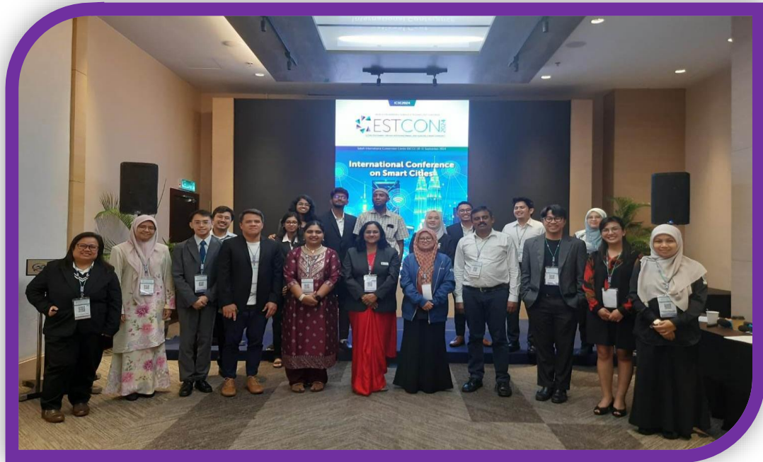
International Conference on Smart Cities 2024