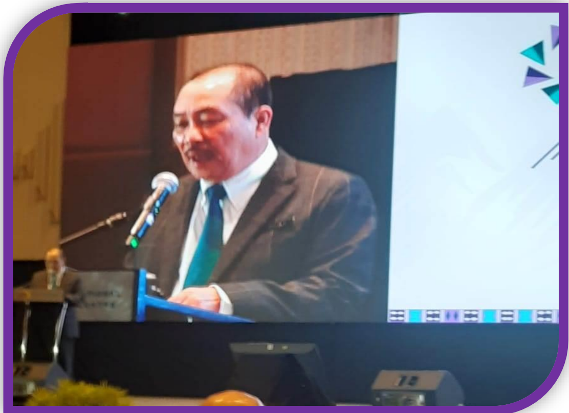
Chief Minister of State of Sabah, Malaysia delivering Inaugural address

Inaugural function of the ESTCON 2024 conference commenced at 10.30 A.M. in the Sabah International Convention Centre (SICC) on 10 th September 2024 Tuesday . Chief Minister of State of Sabah, Malaysia was the Chief Guest for the Inaugural function. Prof. Mohammed Ibrahim, Vice Chancellor of Universiti Teknologi PETRONAS (UTP), Malaysia delivered the Presidential address.