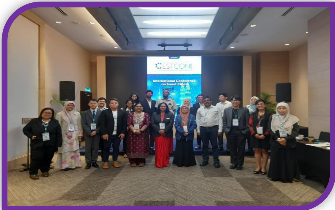
International Conference on Smart Cities 2024 on the 10 th Sept. 2024 A.N Session

Campus: #14, Ramohalli Cross, Kumbalgodu, Mysore Road, Bengaluru – 560074