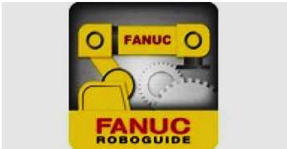
FANUC Roboguide software