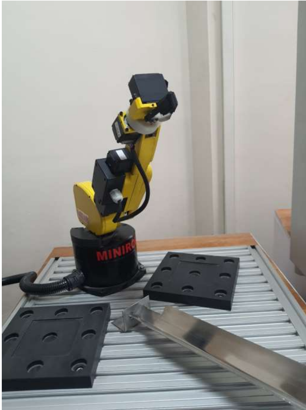
MTAB Mini Robo