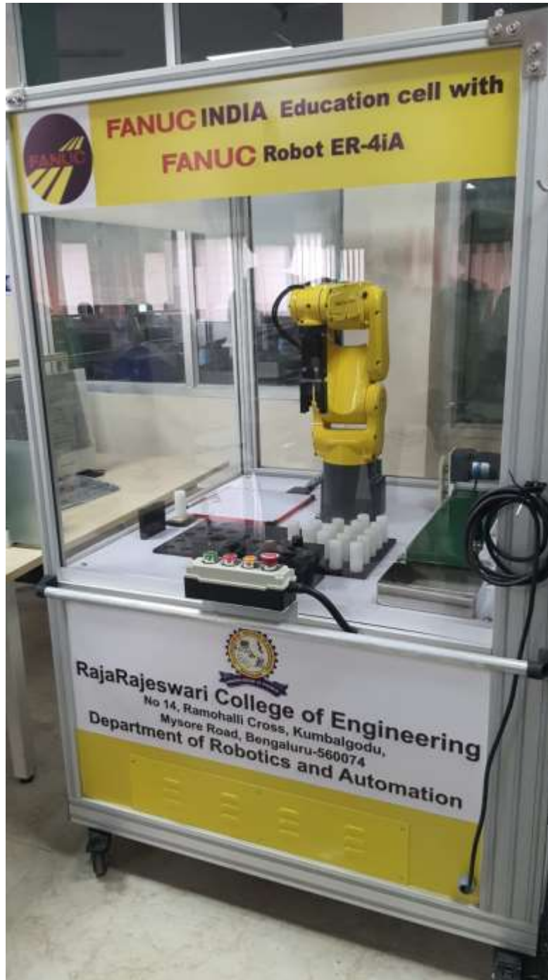
FANUC Robot ER-4iA-6 axis