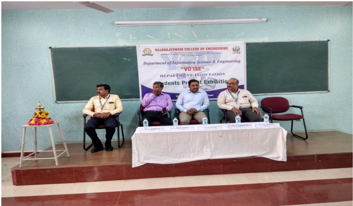
Inauguration of Project / Prototype Exhibition 2019