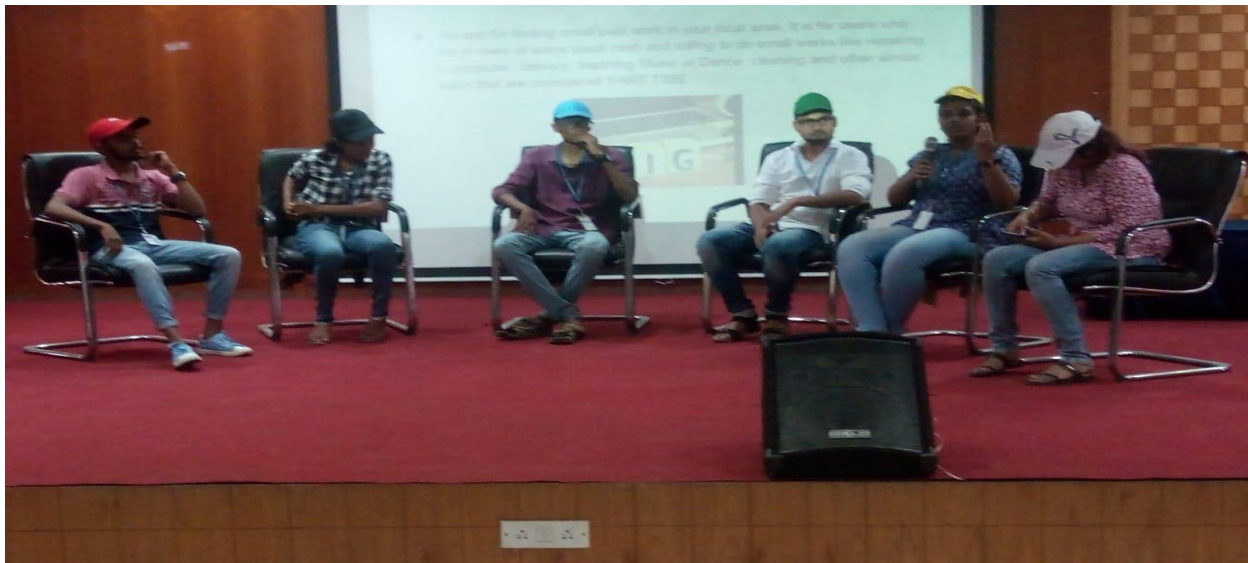
Group Discussion of Team members by applying Six Hat Thinking Techniques