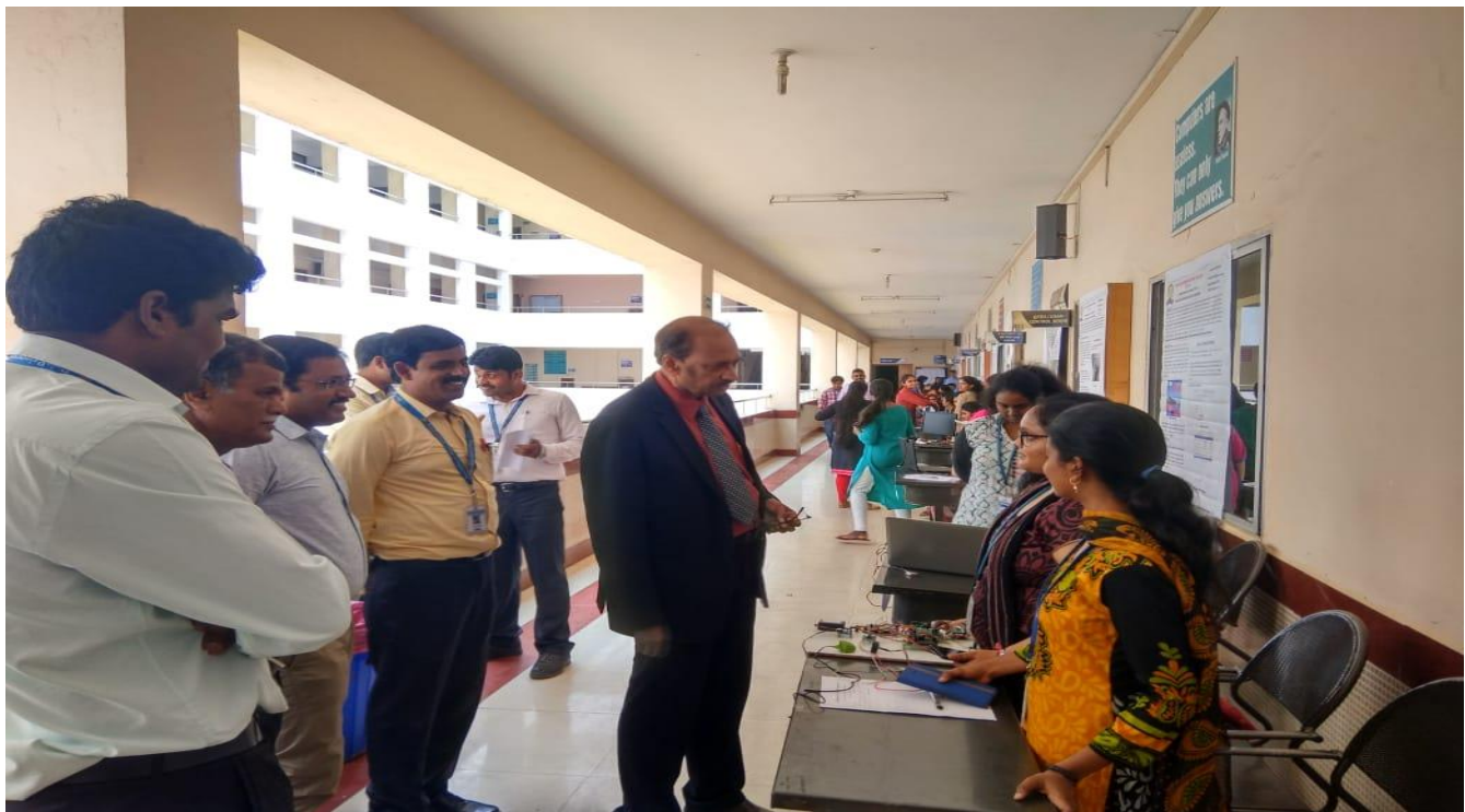
Project Display and Evaluation by Experts

Start up Registration supported by RajaRajeswari Innovation & Incubation Cell