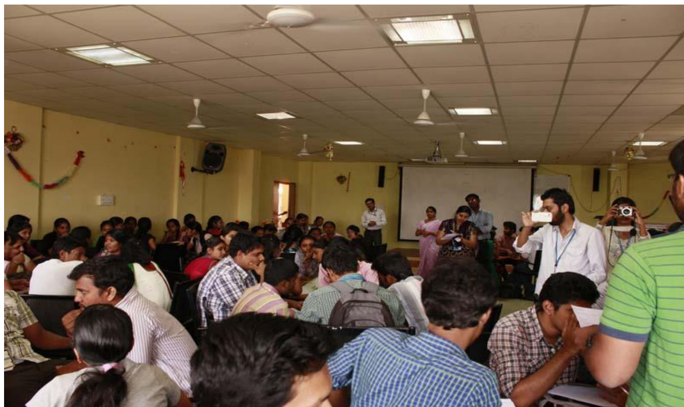
Workshop participation by student members