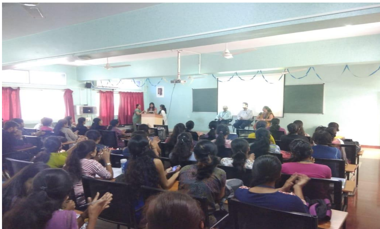
Participants attending the session on “Entrepreneurship as Career”