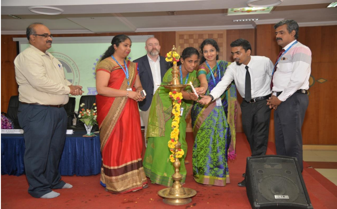
Inauguration of Project Exhibition 2018 on 9 th May 2018