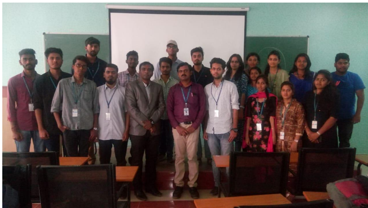
A part of Student Participants of the Problem Solving Techniques Workshop – Group Photo