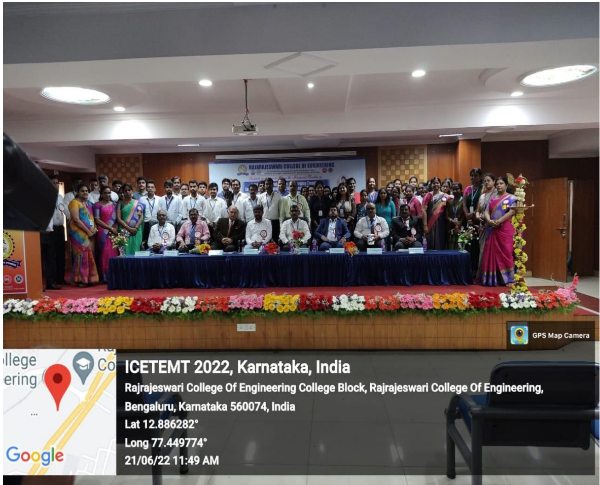
Dignitaries with Participants of ICETEMT 2022