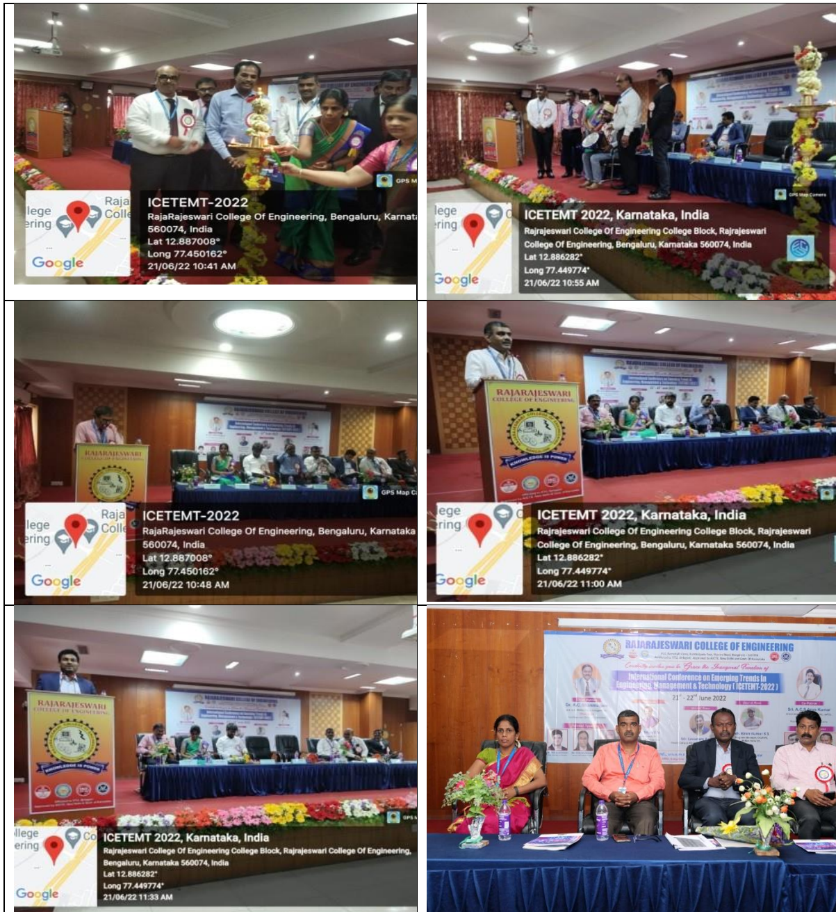
Inaugural Function of ICETEMT- 2022