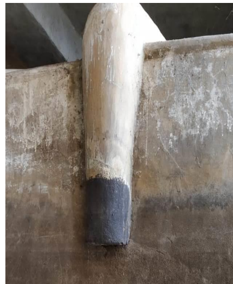
Intake pipe for spillway