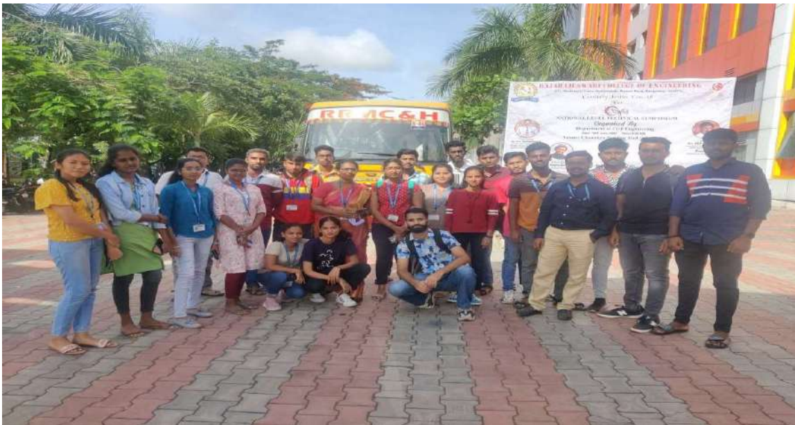
Photo:Students departing to water treatment plant