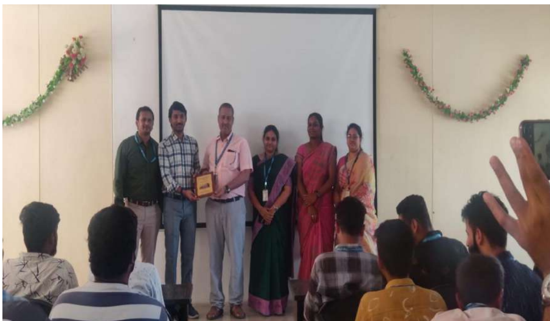
Photo: Felicitation of Chief Guest