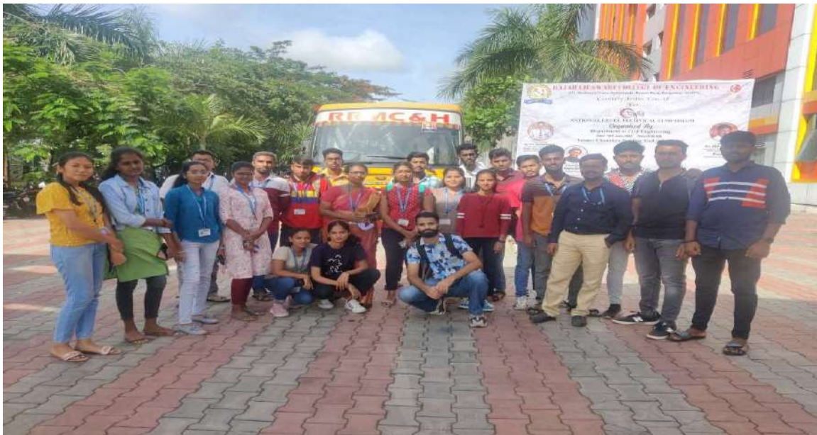
Photo:Students departing to water treatment plant