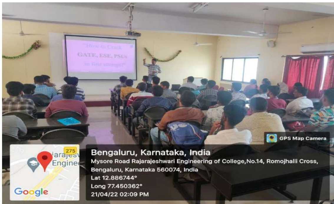
Photo: Chief Guest interacting with students