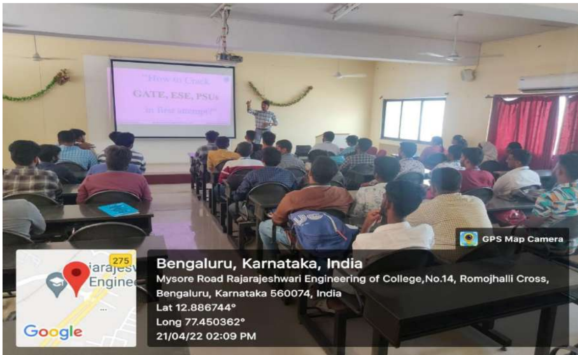
Photo: Chief Guest interacting with students