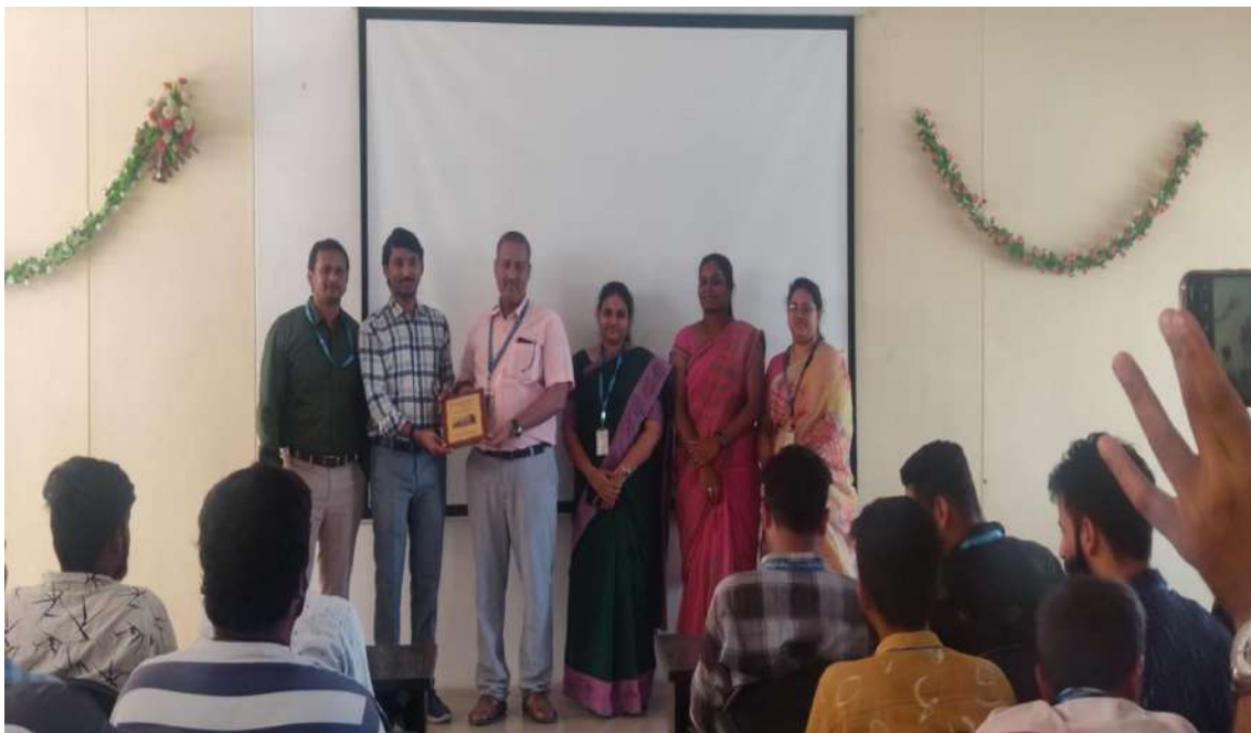
Photo: Felicitation of Chief Guest