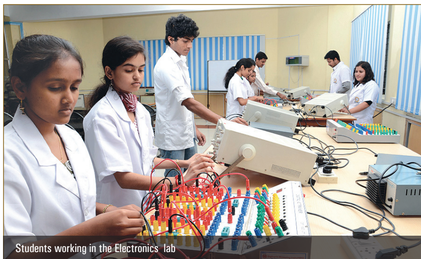
Students working in the Electronics lab

The organizations get an opportunity to interact with students & engage them for pilot and research. Through this students develop good exposure through