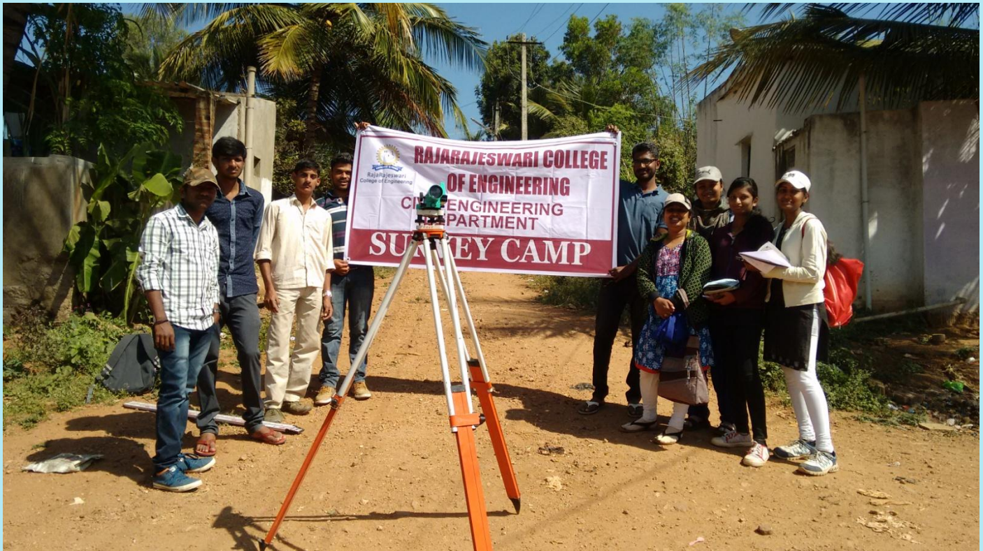
SURVEY CAMP FOR 6 TH SEMESTER STUDENTS