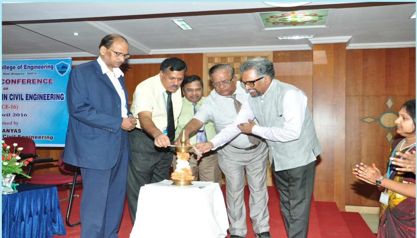
LIGHTENING OF THE LAMP