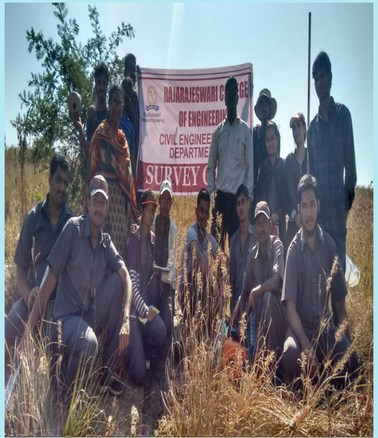
Students National Conference on “Emerging trends in Civil Engineering “on 26 th Feb 2016