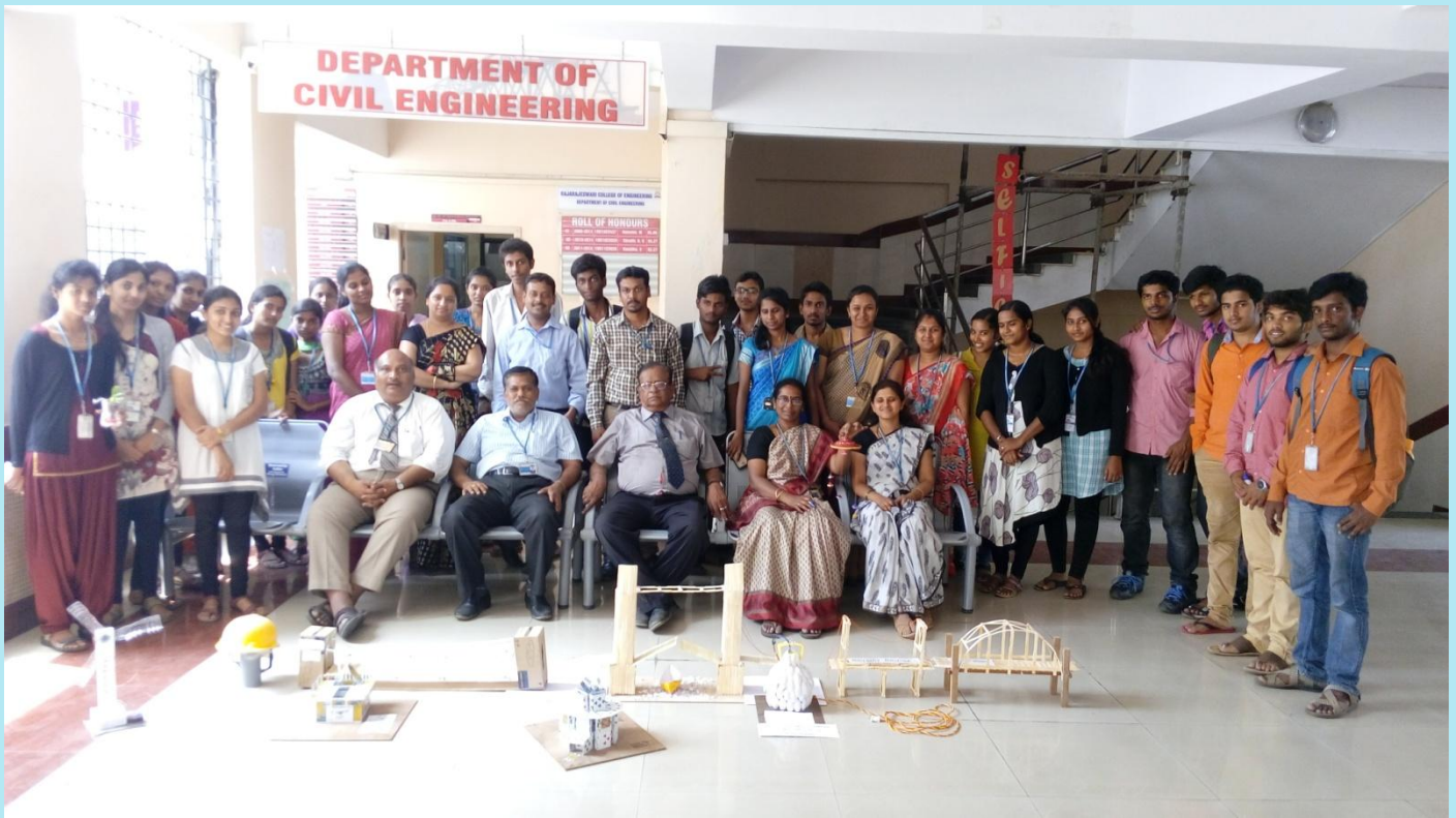
Industrial Visit on 5 th April 2016 to Chandrappa Quarry site and RDC concrete plant